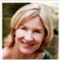
Financial Service Professional Over 6 Million