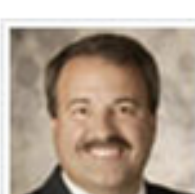
IT Professionals Over 8 Million