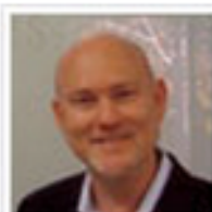
Startup Professionals Over 5.8 Million