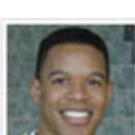
Career Changers Over 1.7 Million