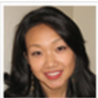
Marketing Professionals Over 3.8 Million