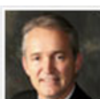
Corporate Executives Over 2.8 Million