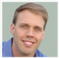
Business Decision Makers Over 15 Million