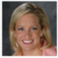
Small & Medium Business Professionals Over 6.4 Million